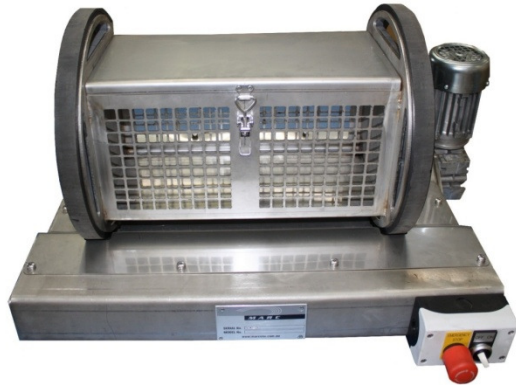
Test Tube Tumbler